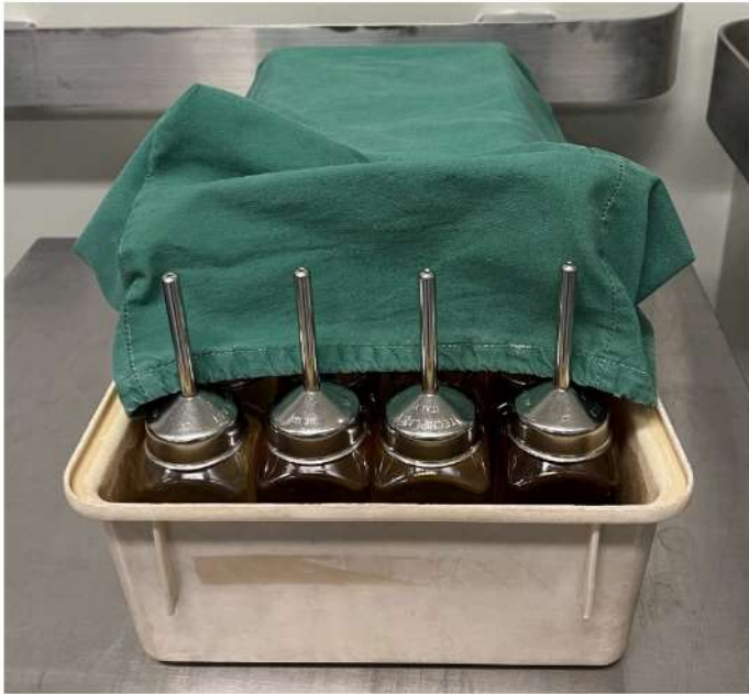
Figure 1. Water bottles arranged in a tray for room storage. Prior to placement, the bottles and nozzles undergo autoclaving for sterilization and are subsequently filled with treated reverse osmosis (RO) water. To maintain cleanliness and minimize contamination risks, a green cloth is used to cover the bottles when stored inside the animal holding room.

RO water was subsequently treated with 5% sodium hypochlorite (Prime Products Pte Ltd., Singapore) to achieve chlorine concentrations ranging from 2 to 3 mg/L. The water pH was maintained between 6.5 and 7.0 using 8% sulfuric acid (Prime Products Pte Ltd., Singapore). Autoclaved 250 ml polyetherimide (PEI) water bottles (GM500 SEALS SAFE Plus, Tecniplast, Buguggiate, Italy) were filled with the treated RO water at the water bottle refilling station inside the facility. The bottles were capped with autoclaved metal nozzles, placed into dedicated crates covered with autoclaved, woven fabric, and stored in an animal holding room (Figure 1).